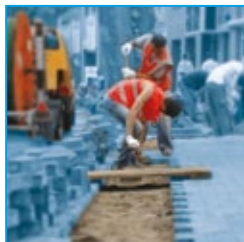
• OSP solution - Direct Buried - Modular - Aerial