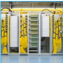
• POP solution