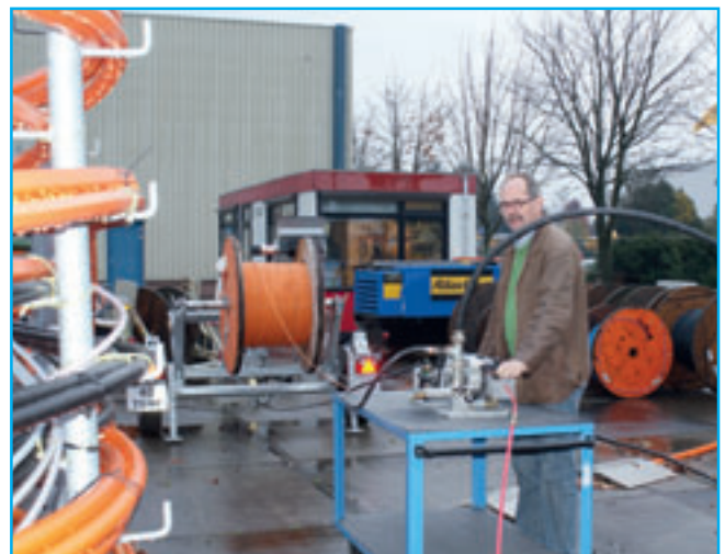
TKF's ACE test facility