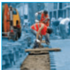
• OSP solution - Direct Buried - Modular - Aerial