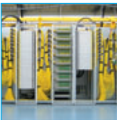
• POP solution